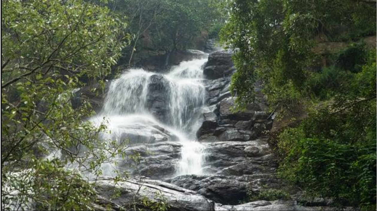
Kiliyur Falls

Your final morning should begin with an early rise to see Kiliyur Falls. This 91m high waterfall is fed by Yercaud Lake and drops into the Kiliyur Valley. The best time to see it is right after the monsoon when it's swollen with rainwater. The climb to see it is arduous but tourists can have a refreshing swim in its clear waters or go on a boat ride in the valley to reward themselves. Those with a more adventurous bent of mind can trek from Yercaud Lake to the waterfall.